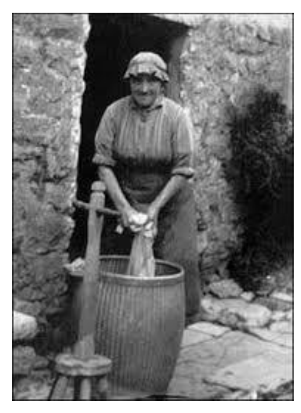
HAS ANYONE STILL GOT A "DOLLY TUB" OR A MANGLE?